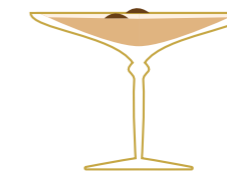
ESPRESSO MARTINI 10.00